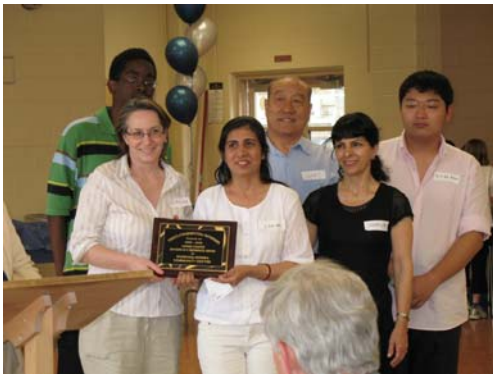
Congratulations to Working Women Community Centre recipient of the 2007-2008 TIGP Seniors in Cyberspace Award.

Working Women Community Centre initiated a Seniors in Cyberspace program in partnership with TIGP in 2005, through a grant from The Ontario Trillium Foundation. The program has continued to flourish throughout the years with over 100 youth and 100 seniors participating in the program. The computer lab was expanded from 10 to 17 computers which enabled more participants in the program. The program expanded in 2007 to include Mandarin-speaking seniors and youth with an emphasis placed on matching seniors and youth based on their first language. Plans are underway to support the development of a new Seniors in Cyberspace program in the Black Creek Community.