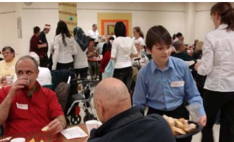
Over 250 seniors enjoy dinner and a theatre performance at the Monarch Park Collegiate, “A Very Halal Christmas Dinner”.

Youth have actively volunteered over their lunch hours to teach community seniors how to use computers and the Internet and extended their community involvement by supporting the TIGP “Temptations” fundraiser and special community events for seniors.